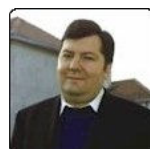
Emanuelis ZINGERIS , Chairman , Member of the Seimas of the Republic of Lithuania